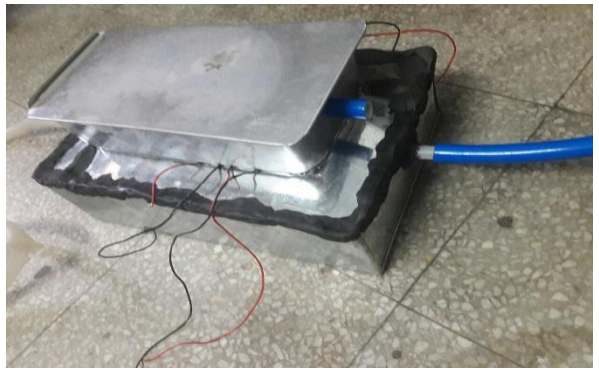
Fig. 3 prototype of device

For experiment and to test feasibility of the concept small prototype using 4 modules is developed and tested. Also the device with 36 modules is designed which will recover its cost in less then 3 years and will produce approximately 500 kW electricity per year.